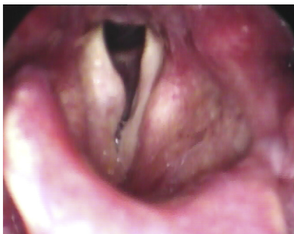
FIGURE 1. Video still of right vocal fold lesion during stroboscopy.

tumor. In retrospect, this process of elimination could have been our only clue to the nature of this lesion.