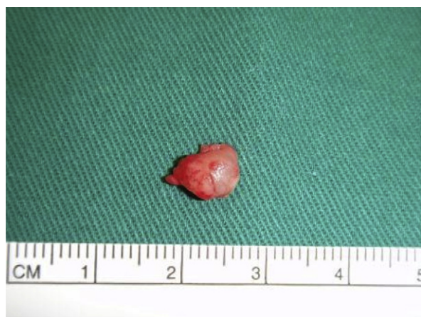
FIGURE 2. Lesion removed in toto from right vocal fold.

Laryngeal neurofibromas frequently affect the supraglottis, namely the arytenoid, aryepiglottic fold, and false folds 2,3 because it is believed that neurofibromas arise from the terminal ramifications of the superior laryngeal nerve in the submucosal space. 4,5 When they arise in the subglottis, their origin is from the recurrent laryngeal nerve. 6 The lesion in our patient was isolated to the glottis and we postulate that a neurofibroma can arise from the encapsulated nerve structure in the vocal fold. In 1989, the human vocal fold was confirmed by Nagai 7 to have encapsulated nerve structures. These structures were located in the connective tissue of the vocalis muscle as well as the subepithelium of the cartilaginous part of the vocal fold. Further examination under electron microscopy revealed that these encapsulated nerve structures contained abundant axon terminals, dense collagen, a striated muscle fiber, and several side branches of nonmyelinated nerve fibers. This complex milieu of neural and fibrous tissue is consistent with the characteristic histologic appearance of neurofibromas whose characteristic features are spindle cells with wavy nuclei, collagen, and trapped nerve fibers. Apart from histological features, a positive immunohistochemical